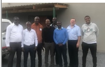
Monthly mens meeting that we started in June.

These are trying times for churches around the globe. After suspending our in person church services in April, during which I preached from our kitchen via Zoom or FB live, we began meeting in person in May. We had to apply through the Zambian Ministry of Health to begin meeting in person. After they came and inspected our building we were granted a certificate to meet as long as we adhered to their requirements. No one under 12 could attend. No more than 50 people and no more than one hour for any service. Everyone has to wear a face mask and seating has to be more than one meter apart. The building had to be sanitized and hand washing provided at all entry points. Probably much of the same things you are having to do to reopen your churches. Even with all of the restrictions it was great to be back assembling with our church family in May. Our attendance has not yet rebounded to where it was and we are missing the children's ministry as well. I keep telling our church I will be glad when we can return to the normal normal and leave behind the new normal.