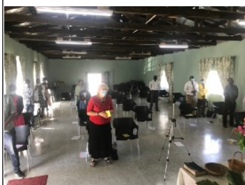
Meeting at our church building in May with the new normal